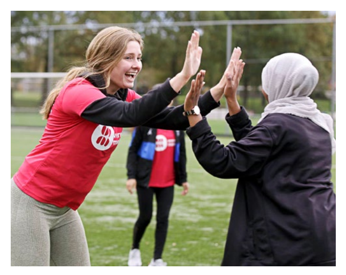
One of the buddies and a refugee participant cheering