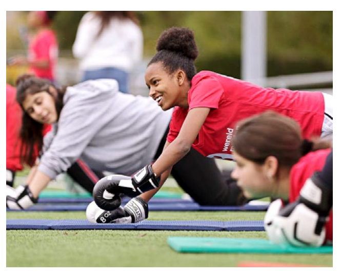
Buddies and participants during training