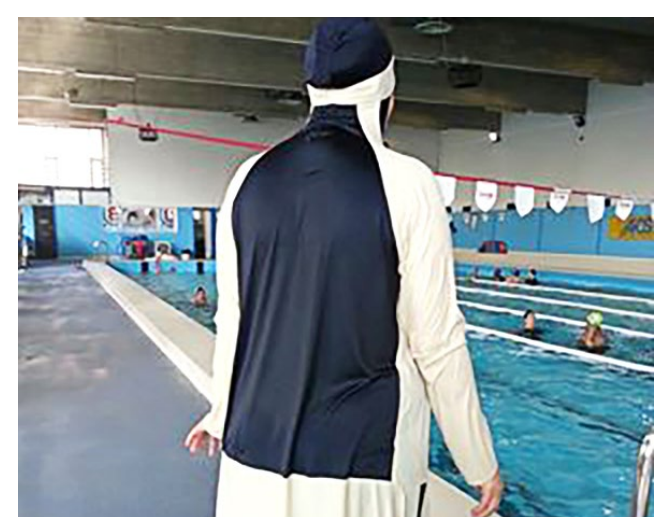
One of the swimmers standing next to the pool