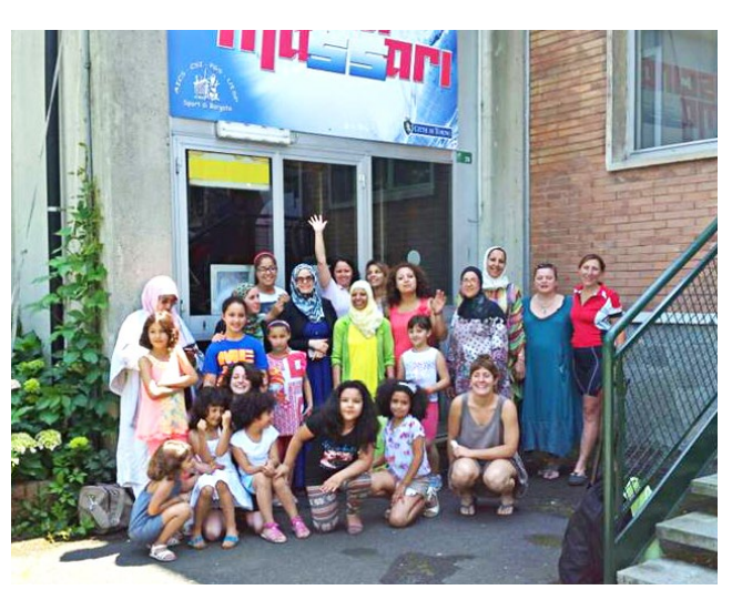
Some of the younger swimmers together with adult participants and instructors in front of the Massari sports center

To give one of many examples, some Muslim women initially felt uncomfortable partaking in a swimming project where most participants wore skin-revealing attire. In addition to not wanting to show their skin to others, the Muslim participants felt unsure if they could trust the instructors' promise that the offer would really be exclusively for women. As a result, many wore leggings and long sleeve shirts under their bathing suits, did not change their clothes in the communal area, and preferred showering at home. In the project's beginning phases, this sometimes led to an uneasy atmosphere within the overall group as some participants felt shy and others were unsure about how to conduct themselves in an unfamiliar situation. While the project implementers could not directly intervene in the women's sense of discomfort, they provided slight modifications that catered to the needs of those who did not want to reveal their skin.